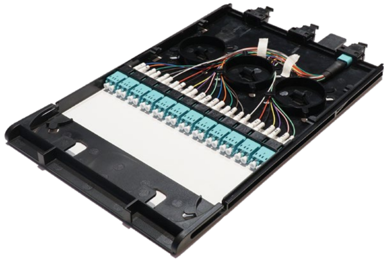
MTP®&MPO Cassette (Inside view)