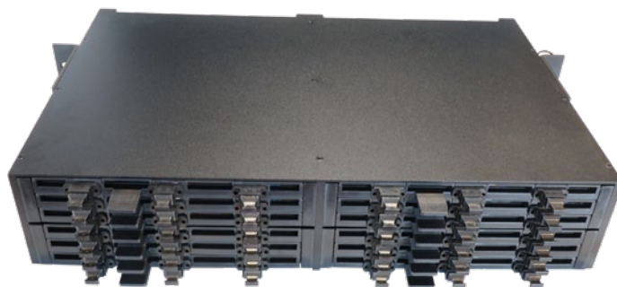
2U Module (Rear view) CAN-HYPE-102