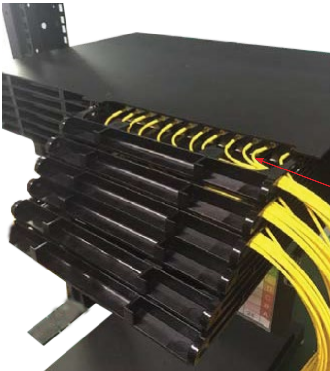
Outgoing Patchcord Management