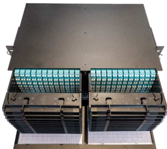
4U Module CAN-HYPE-104